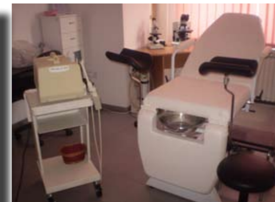
LEFT: Psychological counseling services RIGHT: Medical practice XY